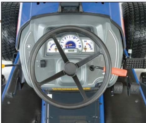
Ergonomic, easy to read dashboard display

2-Pedal hydrostatic control and more legroom increase operator comfort. The new instrument panel and dial in height-of-cut adjustment makes the SXG 326 the most operator friendly and intuitive large compact tractor mower on the market. Hopper capacity is an impressive 600 litres with an easy to remove collector that allows for simple cleaning and maintenance. The large capacity, high torque 1123cc diesel engine is powerful and fuel efficient.